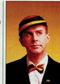
Holly Johnson of Frankie Goes to Hollywood, one of the faces of Eric's club and part of The Beat Goes On exhibition at the World Museum Liverpool until November 2009

The story follows one man's fight for survival as he draws on the defiant spirit of Eric's: do it yourself, and do it your way. Until October 11 at the Liverpool Everyman