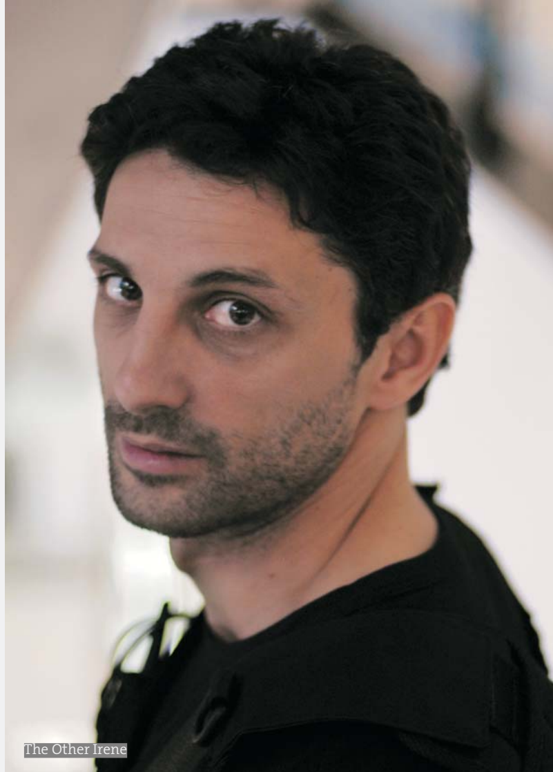
The Other Irene

The Other Irene uncovers a political and bureaucratic landscape that is truly eerie to watch. The clean cinematography, especially apparent in the mall where Aurel works, beautifully emphasizes the main character's solitude and actor Andi Vasluianu delicately performs the brooding desperation that's at work inside this antihero.